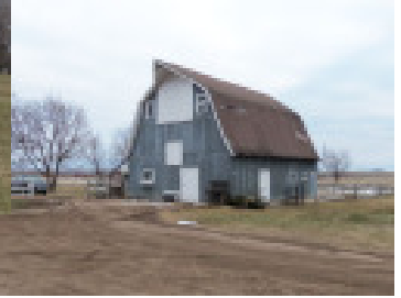
6.72 Acre Hobby Farm

If you have been looking for a perfect country setting this might just be the one you have been waiting for. This three bedroom, two bath home recently had a large addition completed which included a large inviting living room, a main floor laundry, added an additional bathroom and has a 20' x 13' 3 lower level room just waiting for the finishing touches. There is a wood burning fireplace that helps keep heating costs down, a large garden area and a nice grove. To view this house for sale just outside of Morris, MN call American Eagle Realty today at 320.589.4200 to set up your showing.